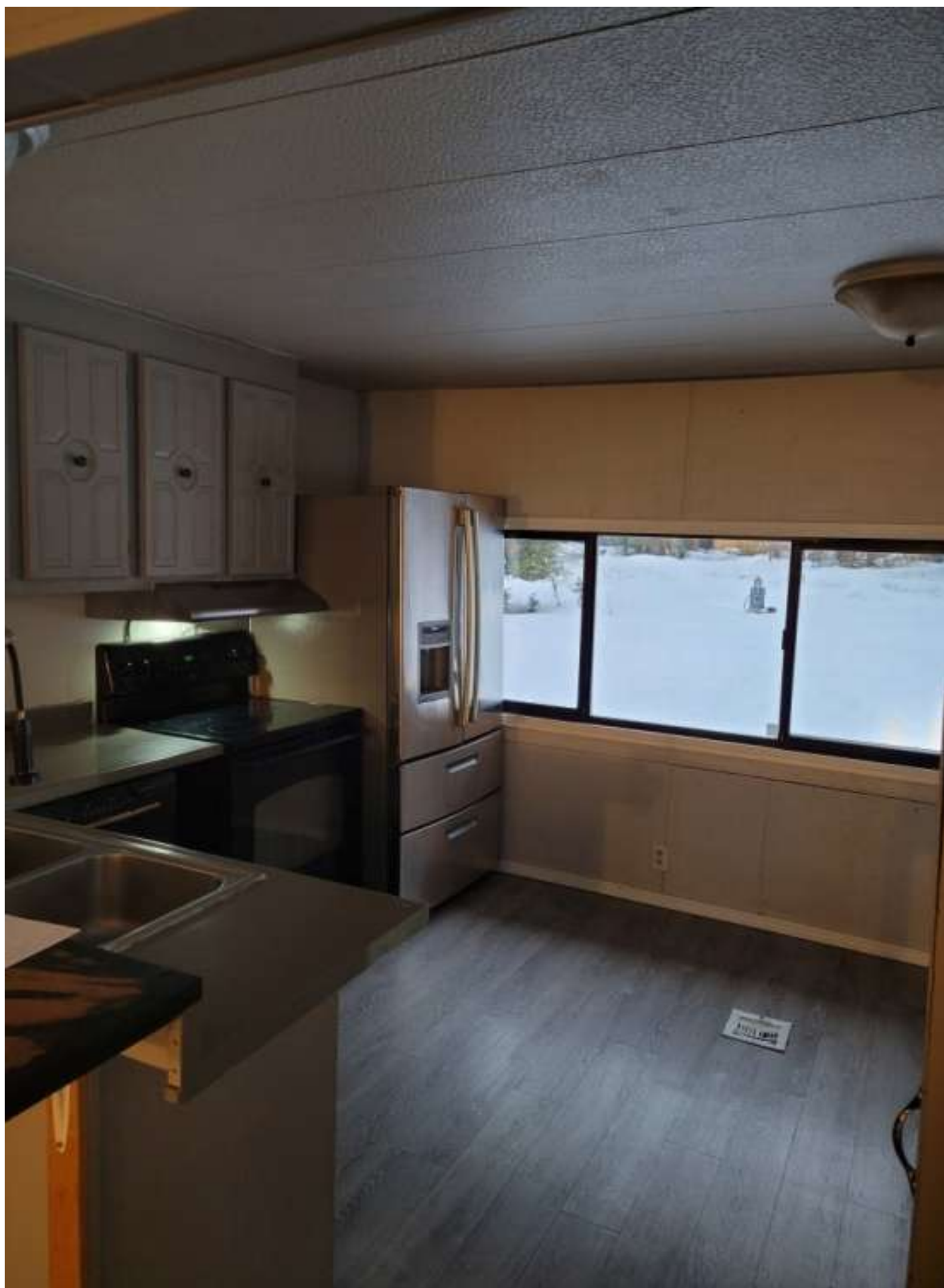
Where dreams begin, Kootenai County, Idaho, 5.00 Acres