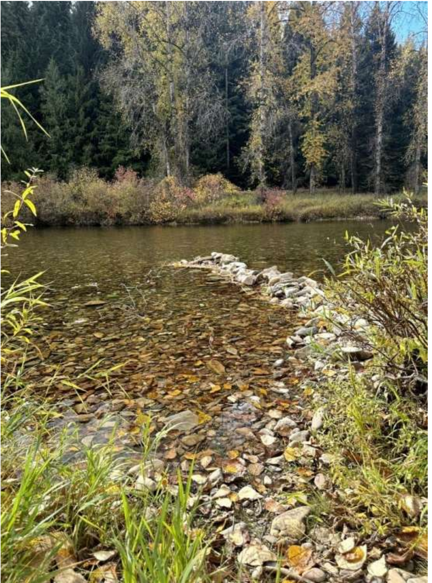
Coeur d' Alene River Retreat, Shoshone County, Idaho, 1.65 Acres