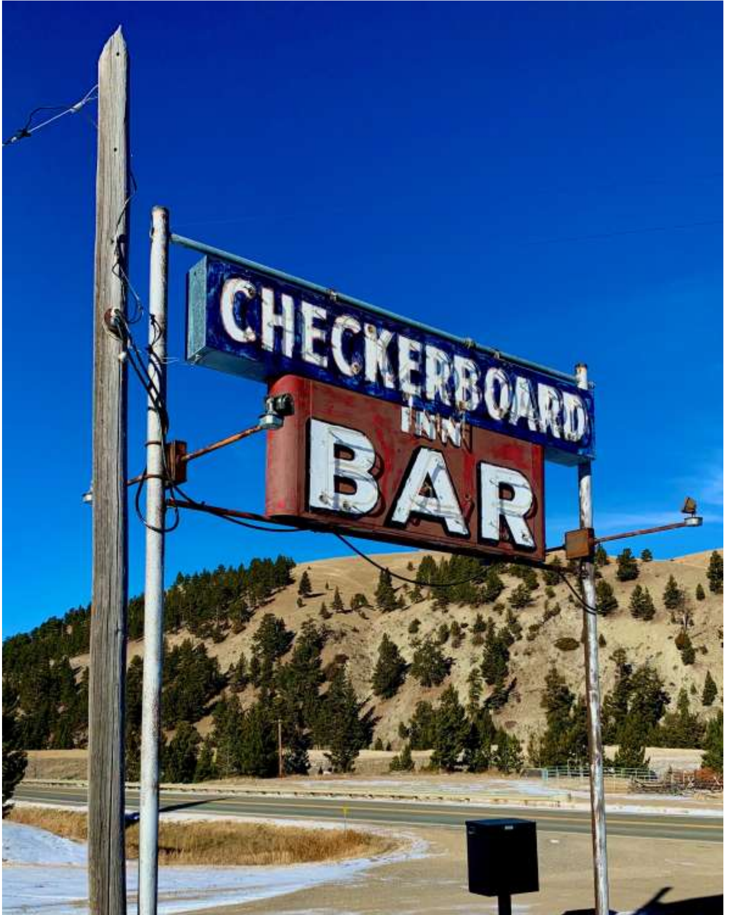
Checkerboard Inn and Bar, Meagher County, Montana, 2.39 Acres