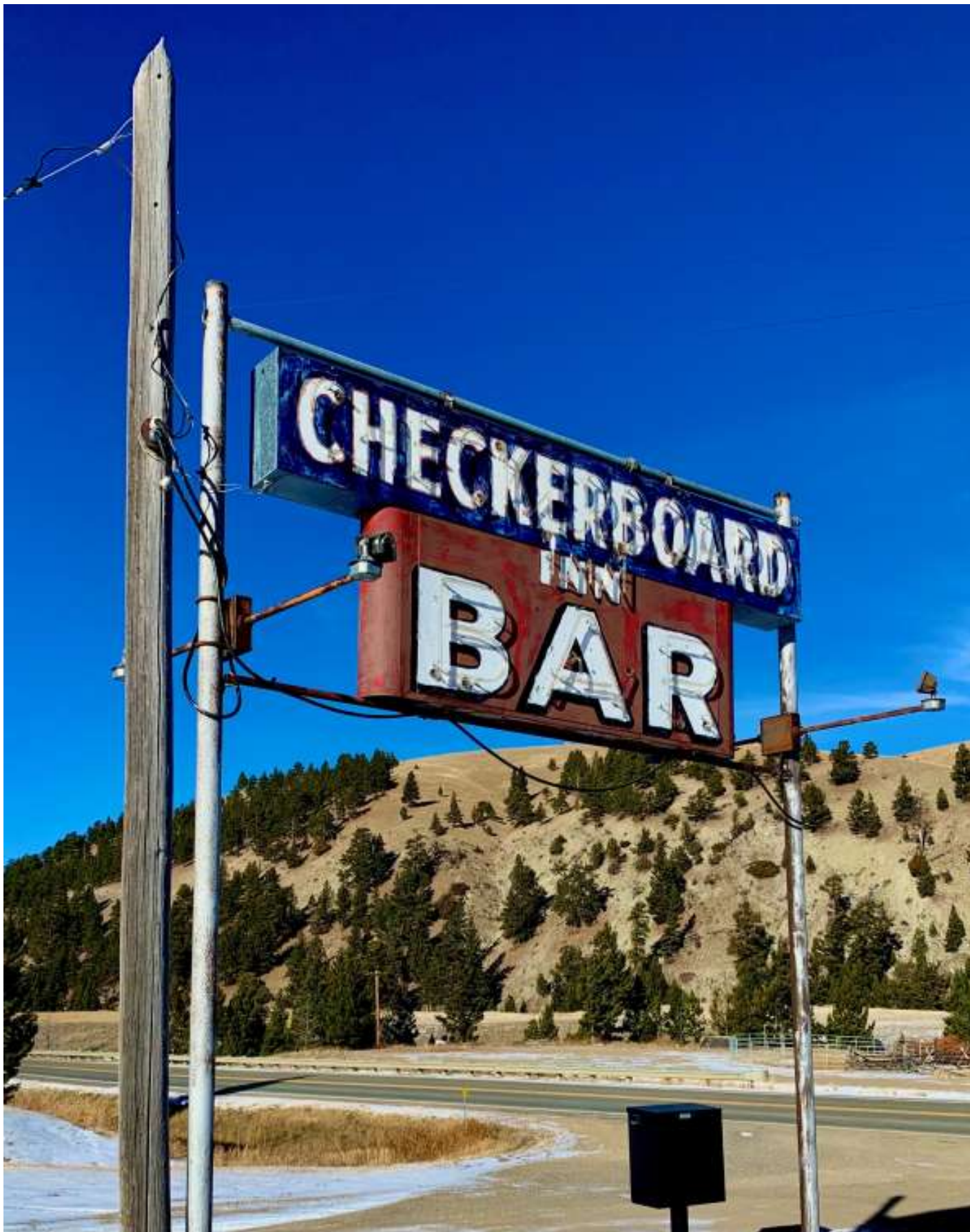
Checkerboard Inn and Bar, Meagher County, Montana, 2.39 Acres