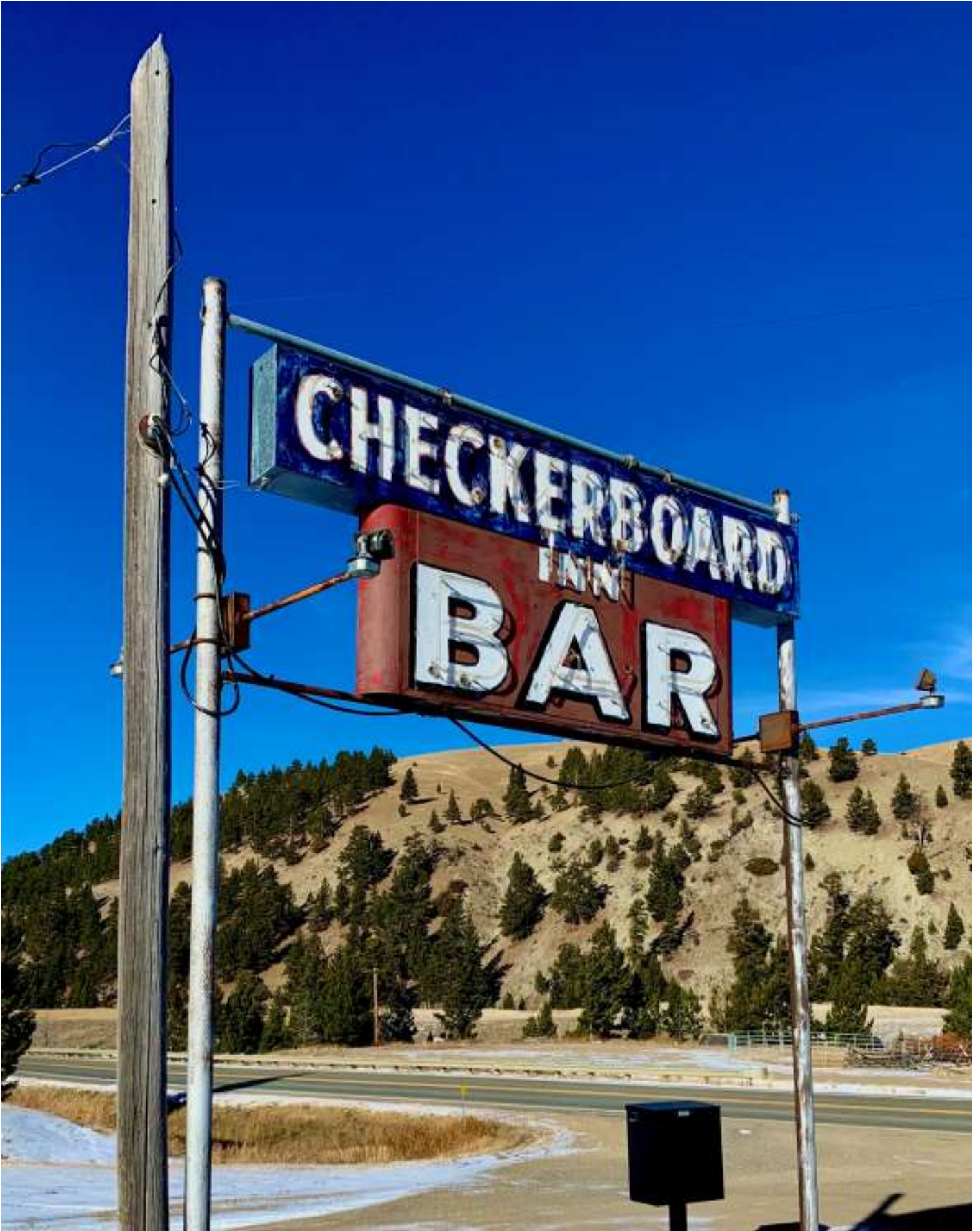
Checkerboard Inn and Bar, Meagher County, Montana, 2.39 Acres