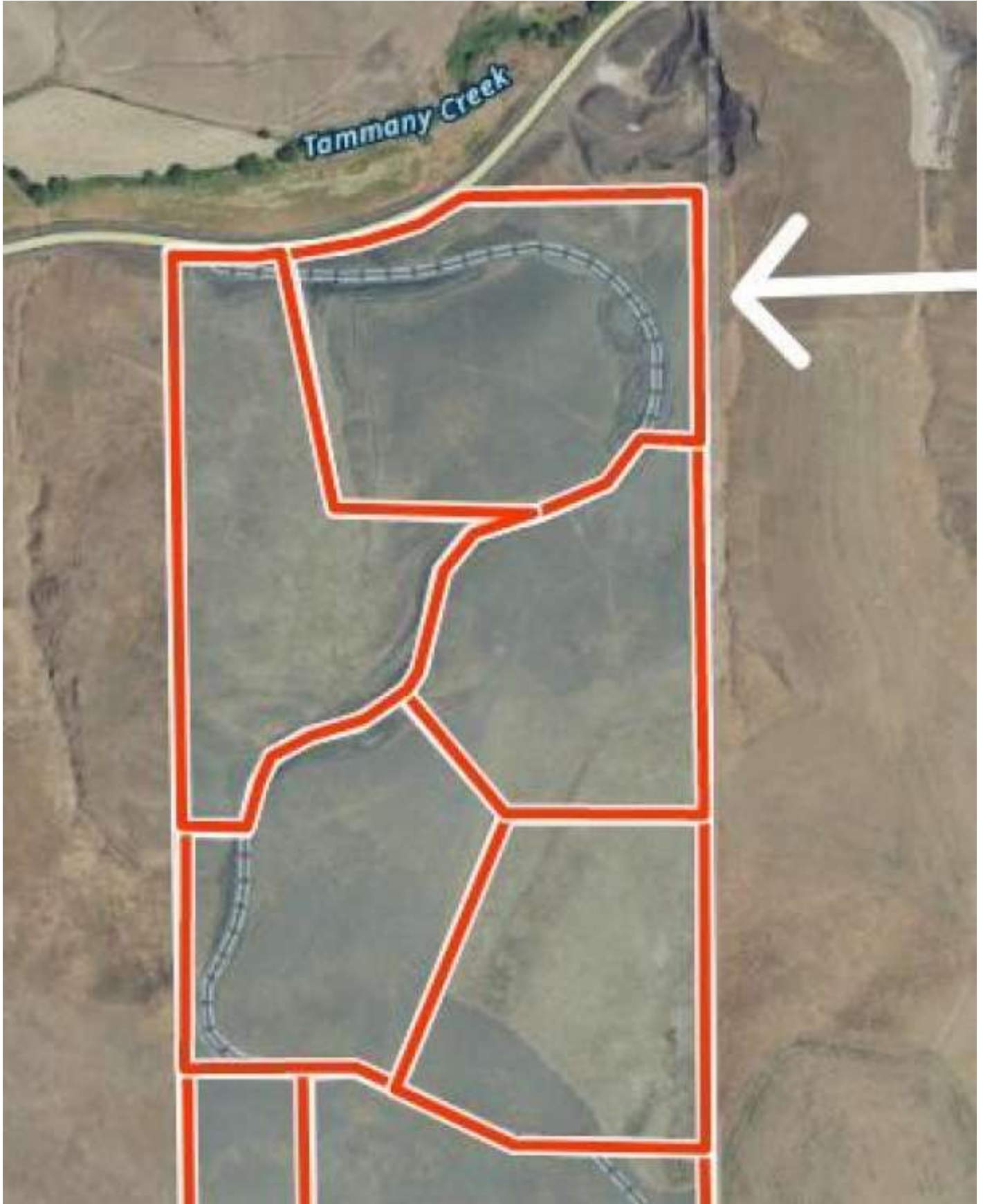
River Rock Ranch Lot 10, Nez Perce County, Idaho, 16.02 Acres