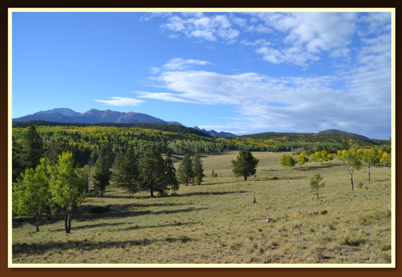
Woodland Park, Colorado (Teller County)