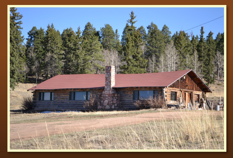
Remnants of Ranch History