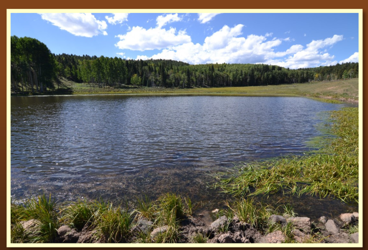
3 +/- Acre Lake Beatrice w/ Water Rights

Listing Broker: Vicki Garrisi | 719.237.1240 (Cell) | Info@TrueWestColorado.com