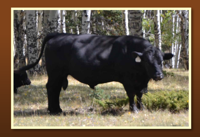
Livestock Ready and Fully Fenced