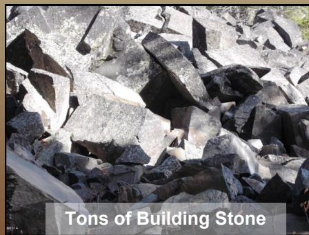
Tons of Building Stone