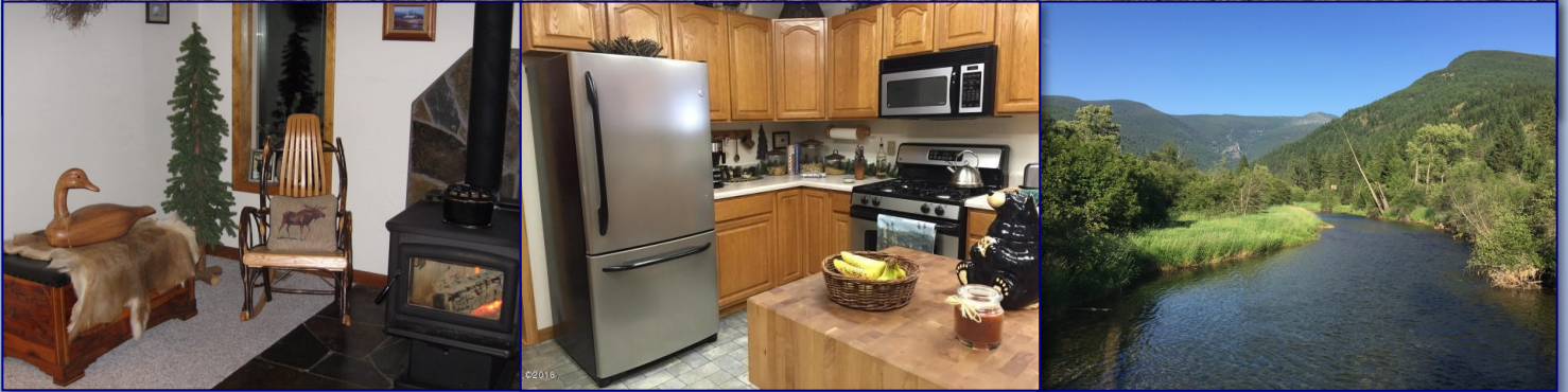
64 Solid Rock Road * Noxon, MT