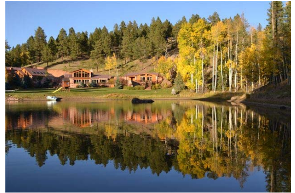
Stocked Fishing Pond