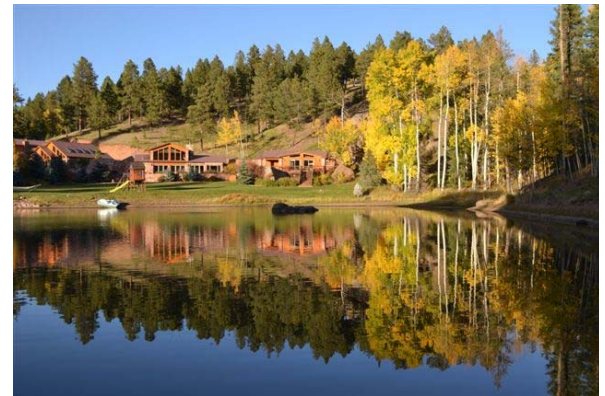
Stocked Fishing Pond