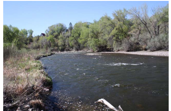
Arkansas River Anyone?