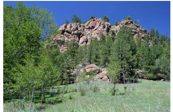
Towering Rock Formations