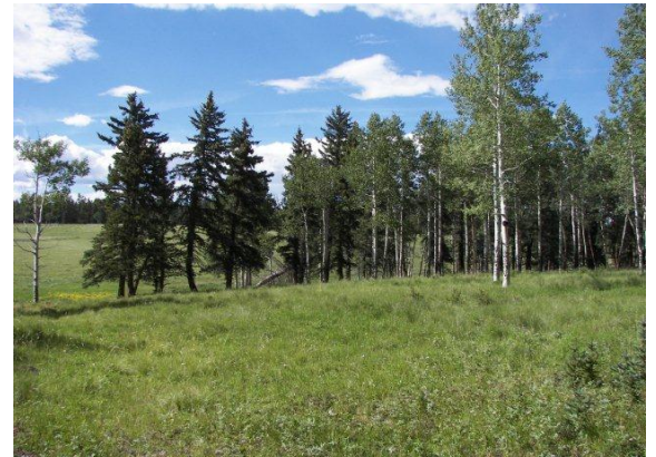
Meadows & Aspen Groves