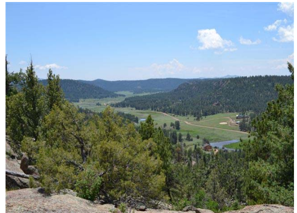
Slater Creek Valley Views