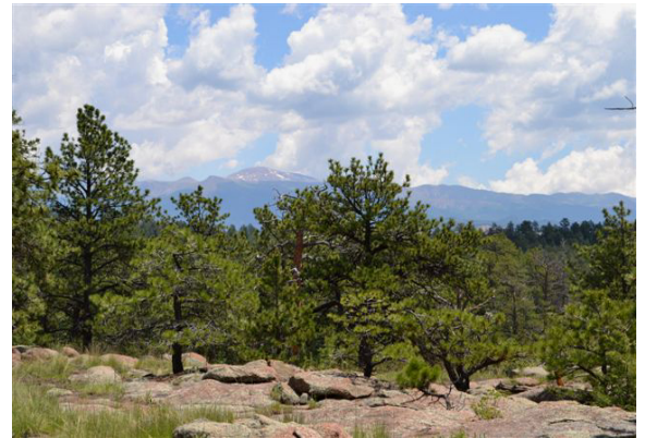
Pikes Peak Views