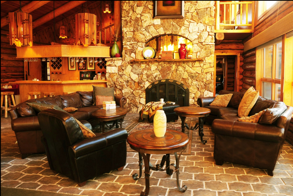
Below: The natural rock fireplace in the great room basks in the views of Salmon Lake.