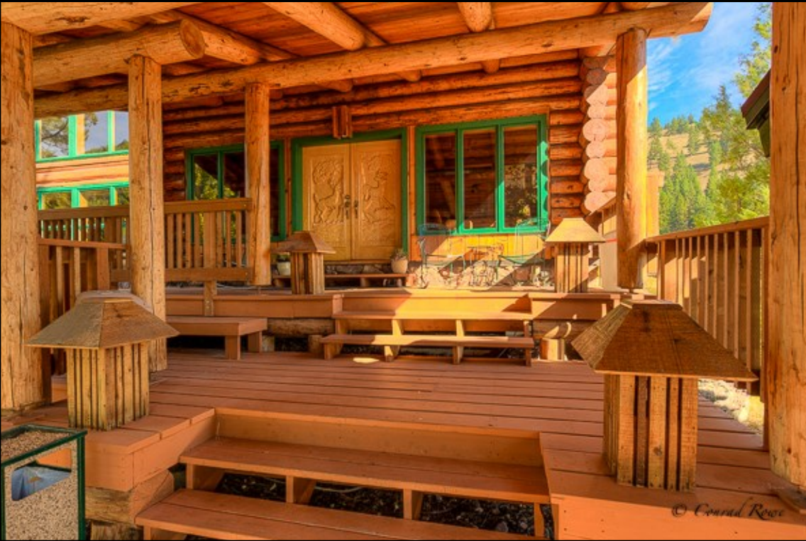
Above: The entrance to the Montana Island Lodge features hand carved wooden doors.