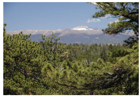
Pikes Peak Views