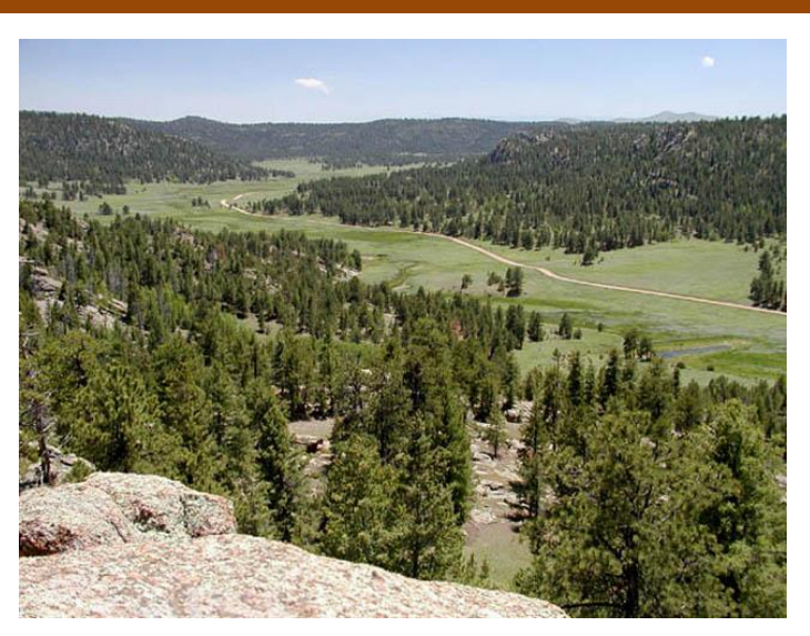
Offered at $185,000