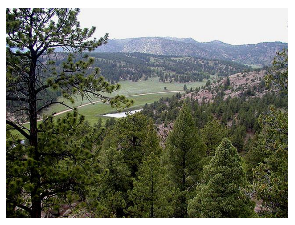
Slater Creek Valley Views