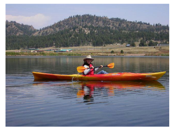
A Great Day on Lake George!