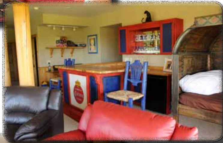
Vintage Corona bar stays, as does built-in desks made from locally sourced woods