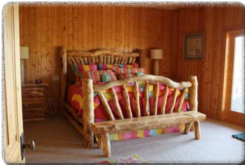
Second bedroom and bath