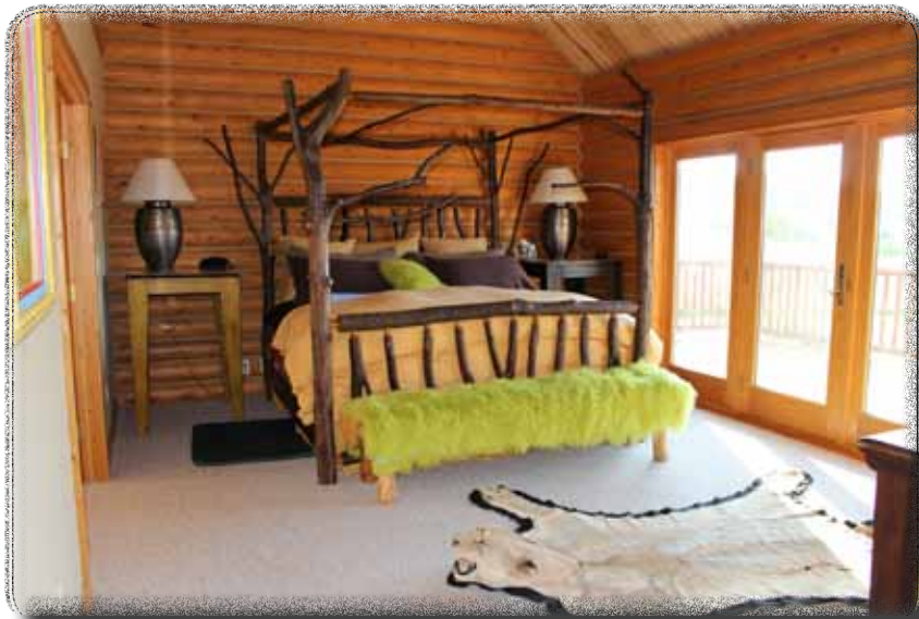
Master bedroom and bath