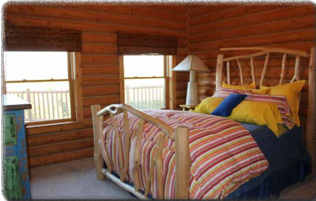
Upstairs - 3rd bedroom - 3/4 bath with large shower across the hall