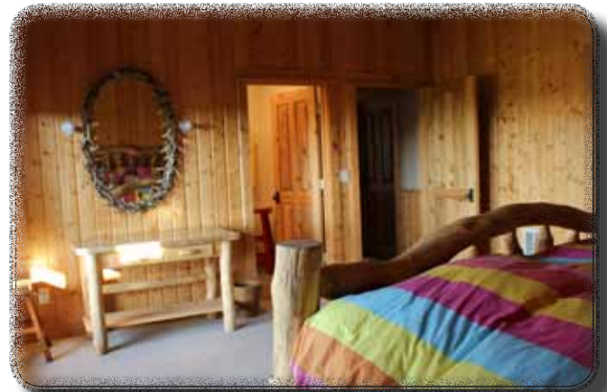
Downstairs bedroom could serve as a master bedroom, with enormous walk-in closet and large attached bathroom with dual sinks.