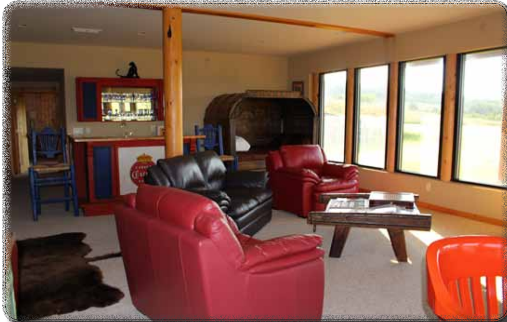
Downstairs "Rec room" and office area