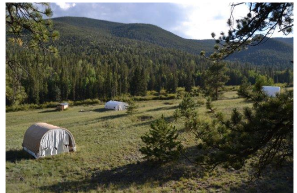
Outdoor Recreation Camp