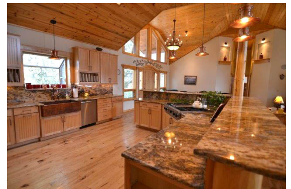
Dream Gourmet Kitchen

Contact Listing Broker: Vicki Garrisi | 719.237.1240 (Cell) | Info@TrueWestColorado.com