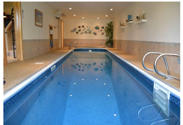
36 Ft. Indoor Pool

Contact Listing Broker: Vicki Garrisi | 719.237.1240 (Cell) | Info@TrueWestColorado.com