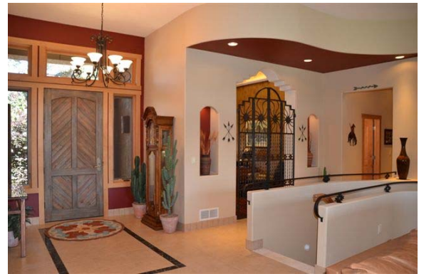
Custom Iron and Woodwork Features